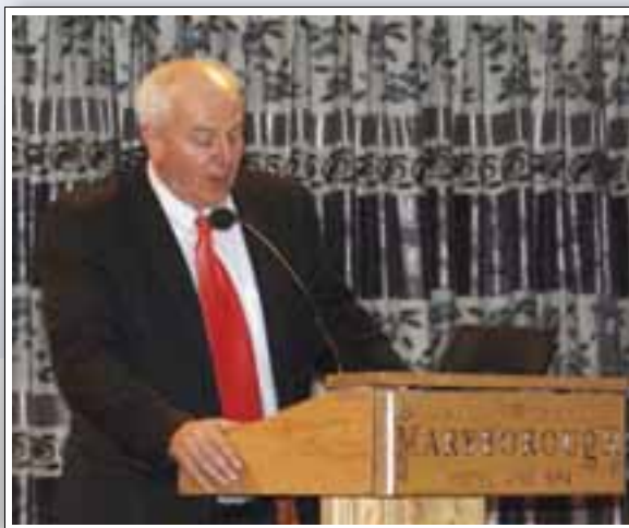
Bobby Kerr, entrepreneur and Dragon's Den investor addressing the Public Libraries Section Conference.