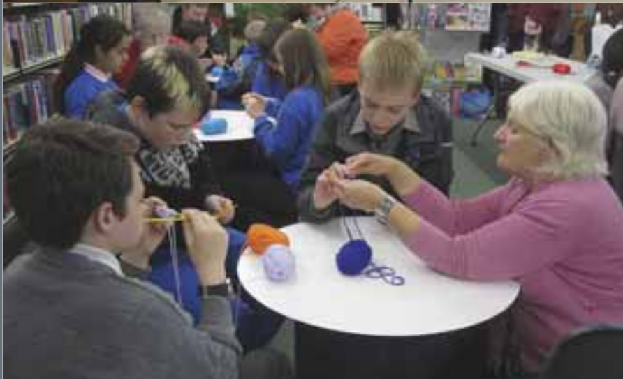
Senior and junior citizens in De Valera Public Library, Ennis

Office and Dublin City Gallery to run an extensive programme of over sixty events encompassing dance, theatre, music, literature, film and poetry. Meath County and Waterford City Council Library Services provided activities with cross-generational components. In Waterford, 'Technoclinics', enabling older people to explore the arts online, matched local Transition Year students with older people in one-to-one workshops. Meath and Tipperary Libraries harnessed local studies expertise.