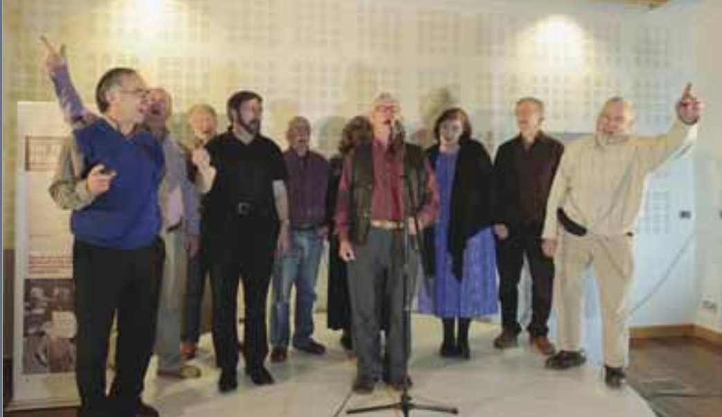
Participants pictured at the Final 'Wild Bees' Nest' Concert at the National Library of Ireland during Bealtaine 2011