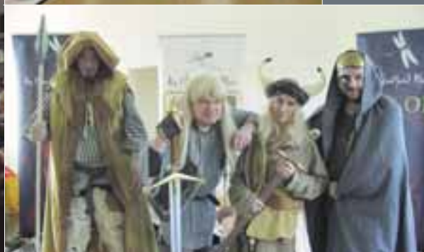
An tSnáthaid Mhór performing their Irish language workshop 'Ar Thóir na bhFathach & na nDragan' in Enniscorthy Library