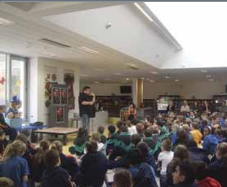
Derek Landy speaking to schoolchildren at the County Library, Tallaght during Children's Book Festival 2011