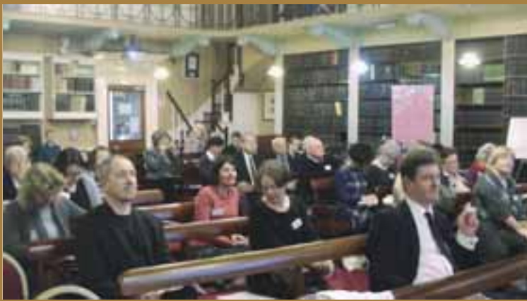
View of the audience at the RBG seminar 'Printed Treasures: Unique collections in Irish Libraries' held in the RIA