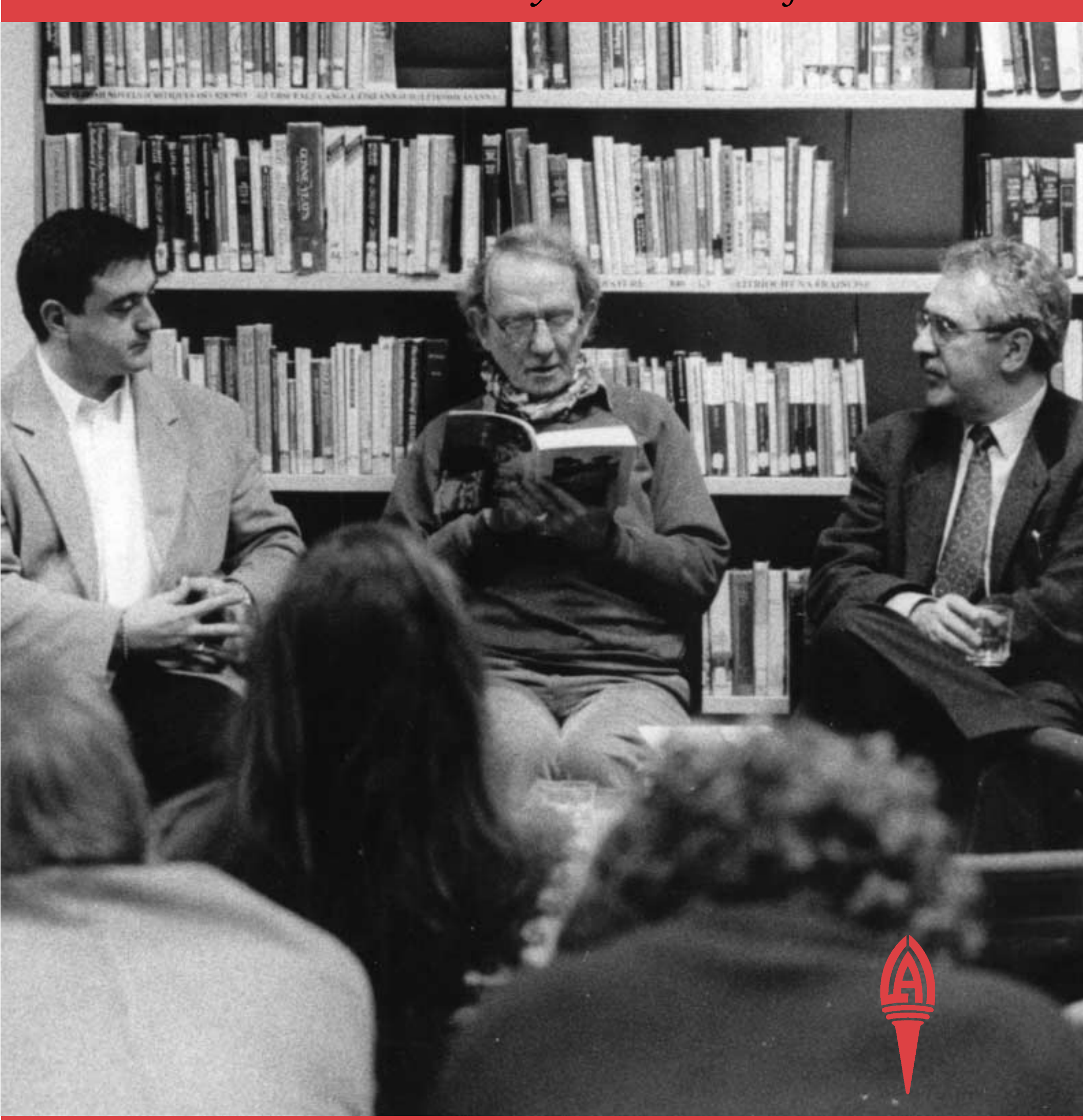
ANNUAL REPORT 2000